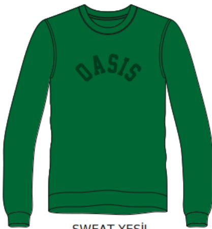
SWEAT YEŞİL KABARTMA