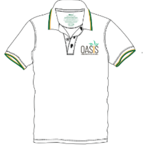
PIKE KISA BEYAZ