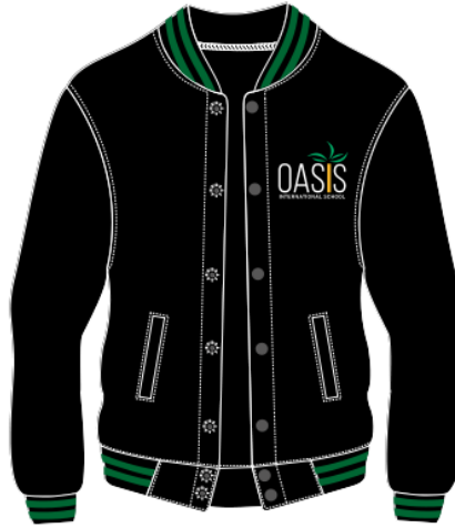
KOLEJ CEKET SİYAH